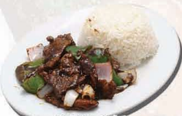
黑椒牛肉饭 Black Pepper Beef Rice