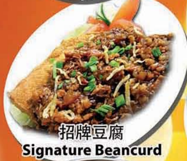
招牌豆腐 Signature Beancurd