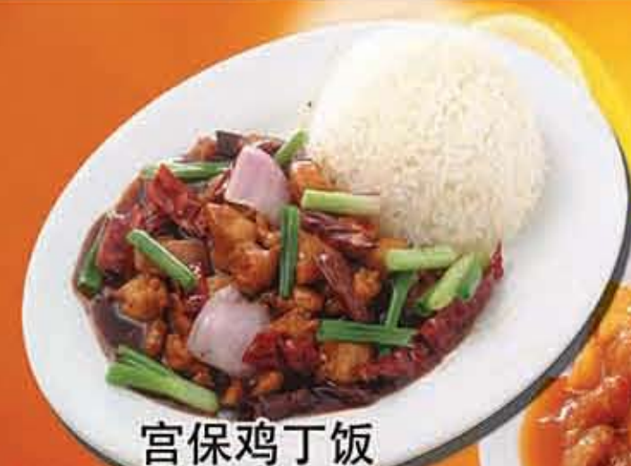
宫保鸡丁饭 Dries Chilli Chicken Rice