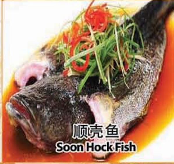
顺壳鱼 Soon Hock Fish