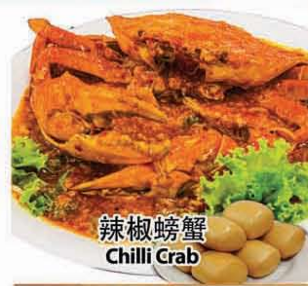
辣椒螃蟹 Chilli Crab