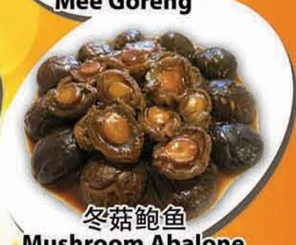
冬菇鲍鱼 Mushroom Abalone