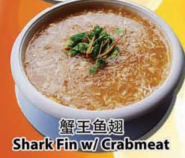
蟹王鱼翅 Shark Fin w/ Crabmeat