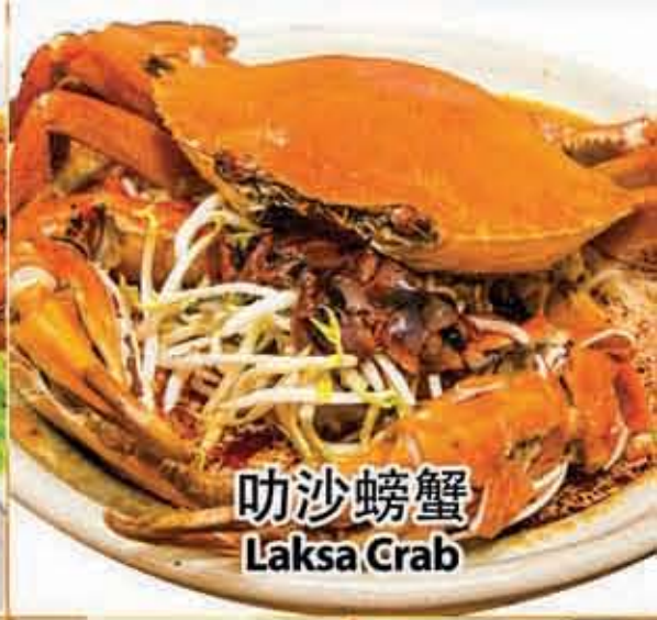
叻沙螃蟹 Laksa Crab