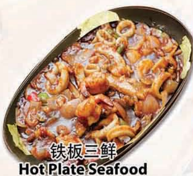
铁板三鲜 Hot Plate Seafood