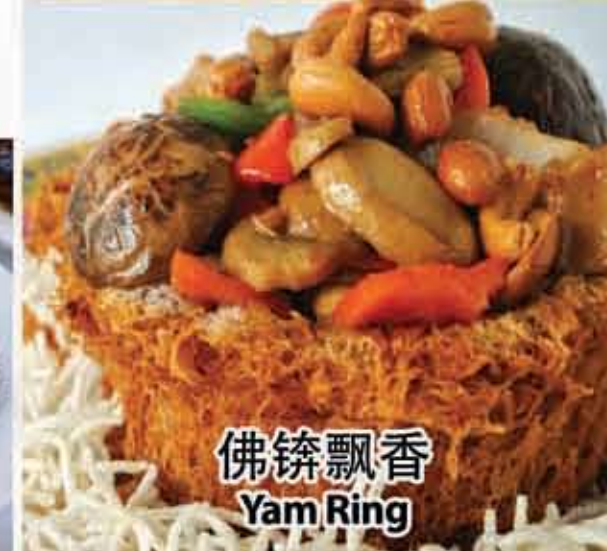
佛手飘香 Yam Ring