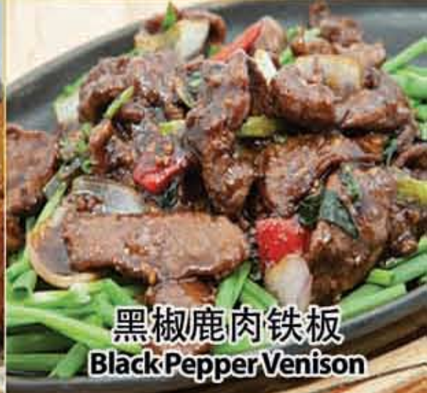
黑椒鹿肉铁板 Black Pepper Venison