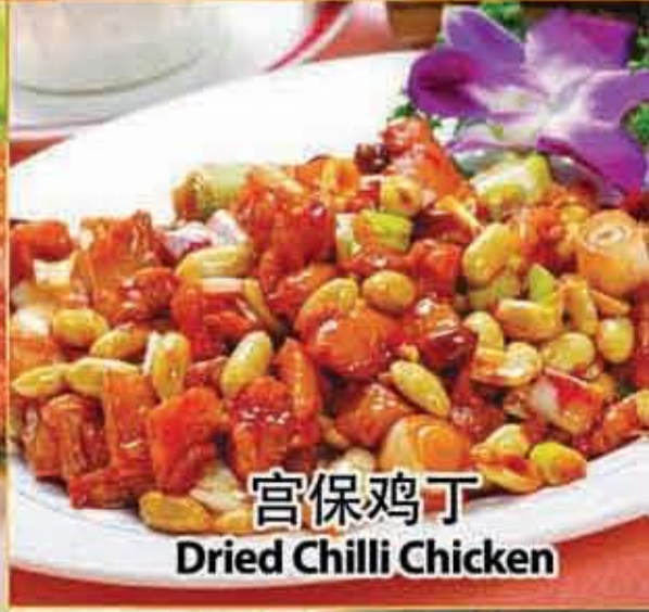
宫保鸡丁 Dried Chilli Chicken