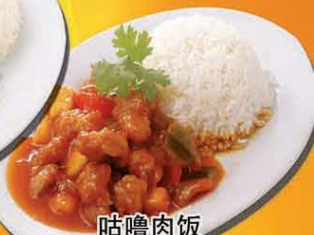
咕嚕肉饭 Sweet & Sour Pork Rice