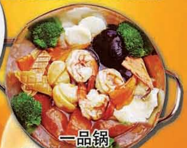
一品锅 Seafood Treasure