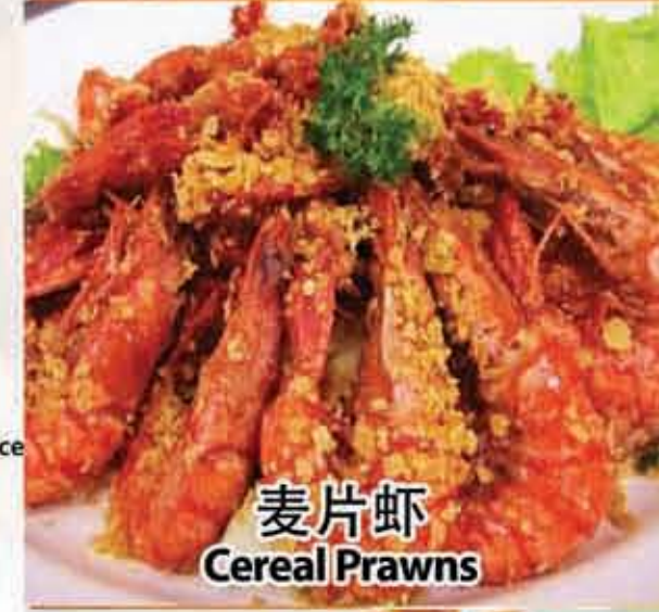
麦片虾 Cereal Prawns