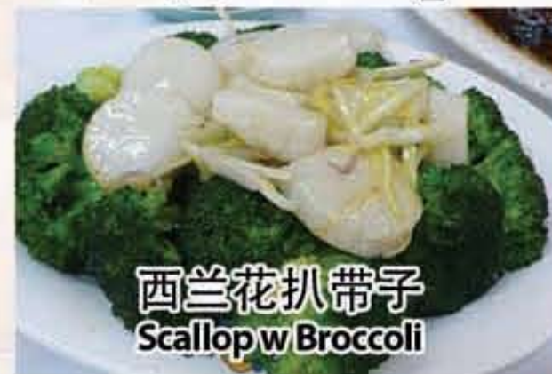
西兰花扒带子 Scallop w Broccoli