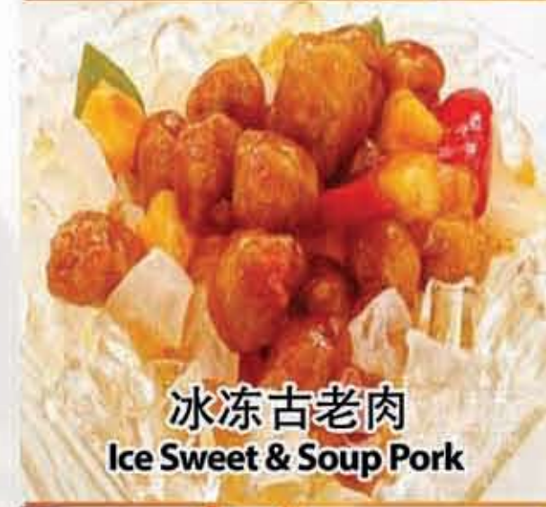
冰冻古老肉 Ice Sweet & Soup Pork